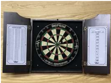
The Dart Board