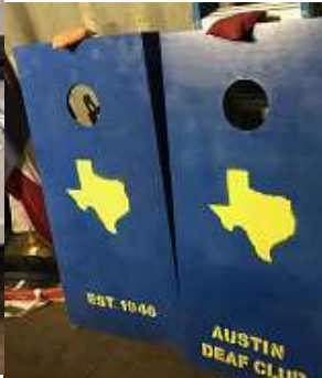
The Cornhole (Wood)